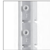
Numbered nail ways are 1" on center for easy measuring and drain calculation.