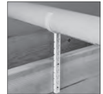
Support horizontal runs of vent pipe in the attic.