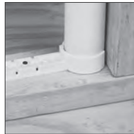
Glue to DWV pipe to support vertical runs.