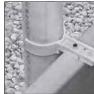
Secure pipe to form for stack placement inside stud wall.